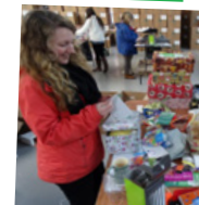
Volunteers sort & pack the boxes