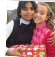
Distributed to children & families in SE Europe