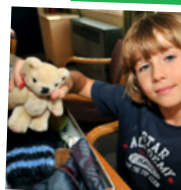
Enjoy packing your shoebox