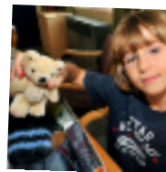
Enjoy packing your shoebox