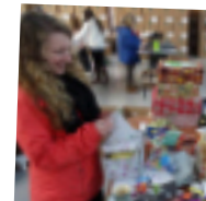
Volunteers sort & pack the boxes