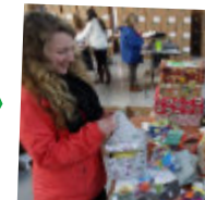
Volunteers sort & pack the boxes