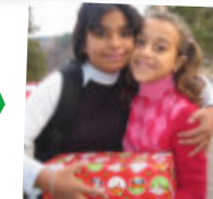
Distributed to children & families in SE Europe