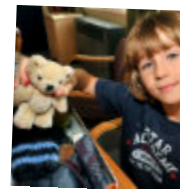
Enjoy packing your shoebox